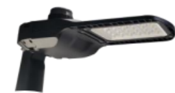
Pole top mounting