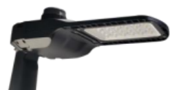
Pole top mounting