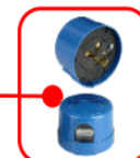
PE Cell (n/a in -N model)