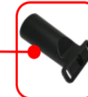
Ø36-40mm Spigot Replacement