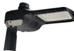
Pole top mounting